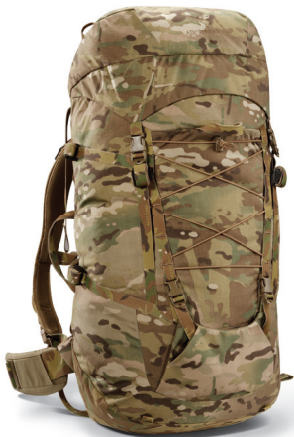
Khyber 50 - MultiCam®