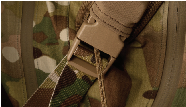
QUICK RELEASE BUCKLES