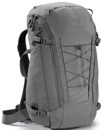
Khard 30 - Wolf