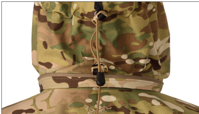
ONE HANDED DRAWCORD HOOD ADJUSTMENT