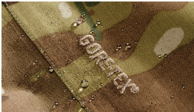
GORE-TEX® WATERPROOF/BREATHABLE FABRICS