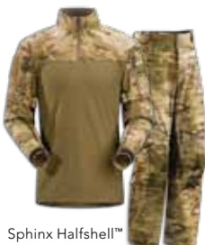
Sphinx Halfshell™ & Pant