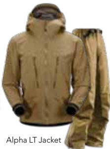
Alpha LT Jacket