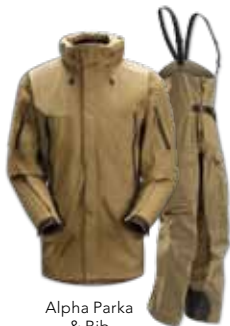
Alpha Parka & Bib