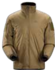
Atom AF Jacket