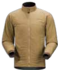
Atom LT Jacket