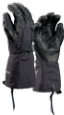
Alpha SV Glove