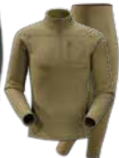
Rho Top & Bottom