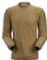
Chimera Shirt LS