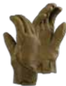
Tactician AR Glove