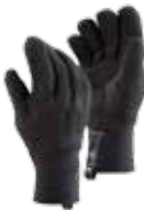
Delta AR Glove