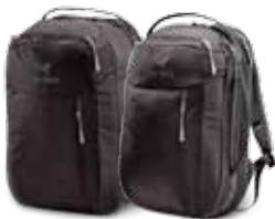
Blade Pack 30 & 24