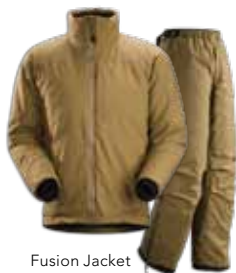
Fusion Jacket & Pant