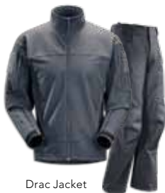
Drac Jacket & Pant