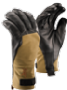
Cam SV Glove