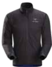
Atom LT Pullover