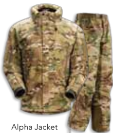
Alpha Jacket & Pant