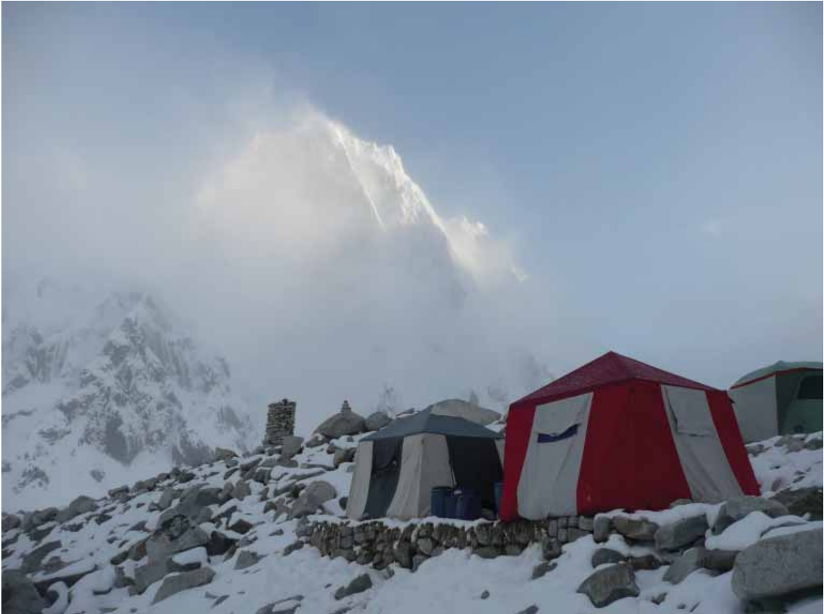
Base camp with Latok 1 behind.