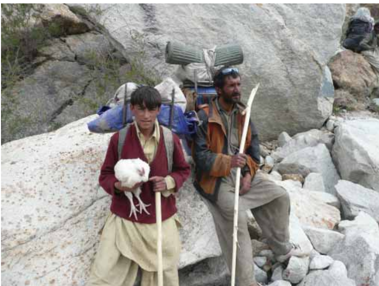
Balti porters hand carrying chickens for four days to base camp.