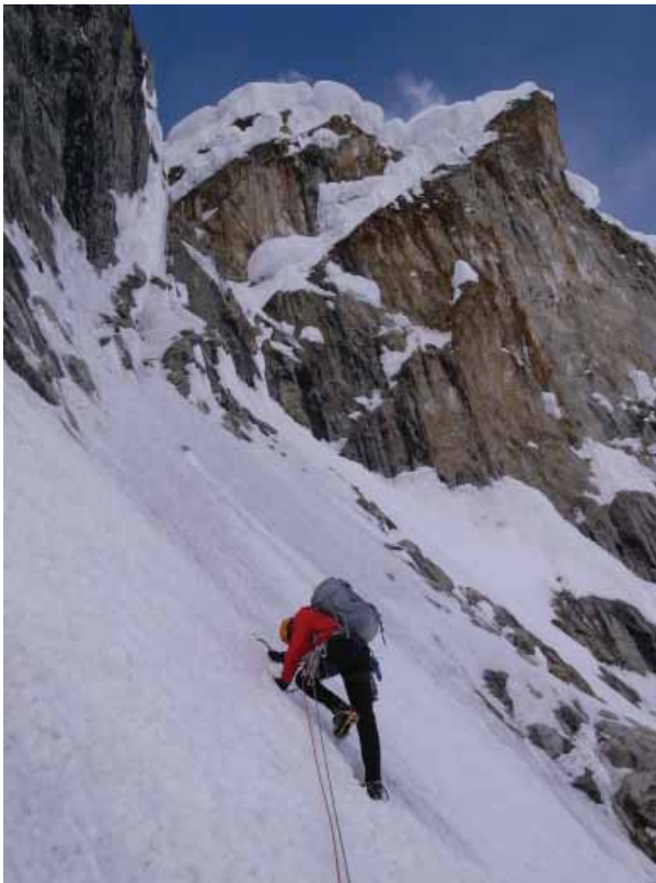
Dylan leading toward the ridge crest.