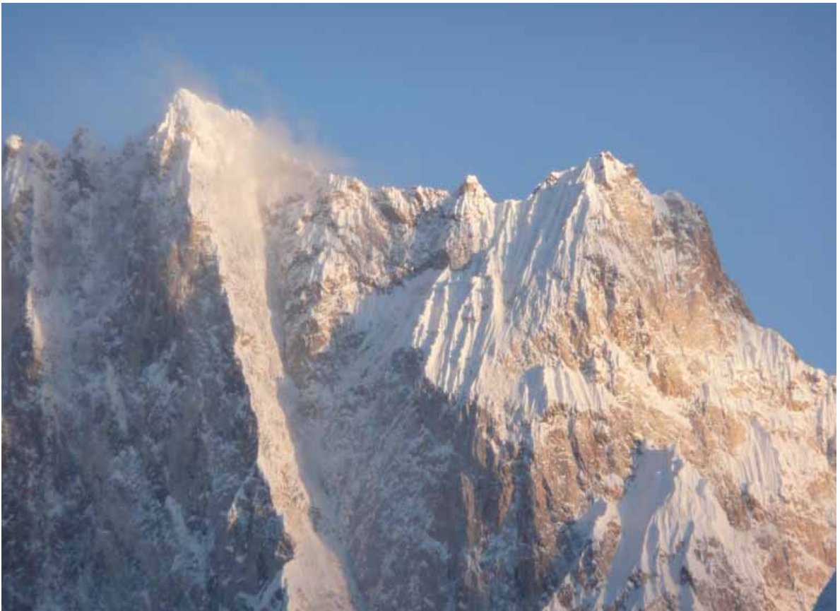
The upper north ridge.