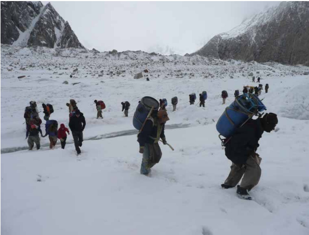
Trekking on the Choktoi.